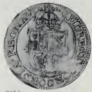
Lot No. 2854